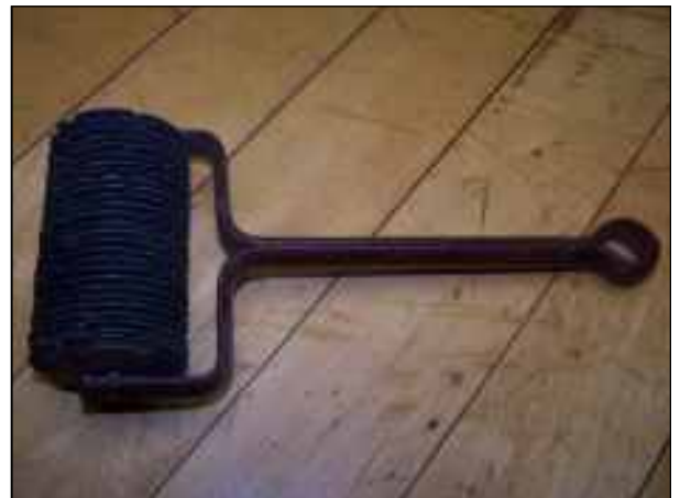
I AM A ROLLER WITH NUMEROUS DISC'S...WHAT AM I?